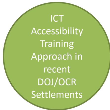
Whole Institution (Top-down)